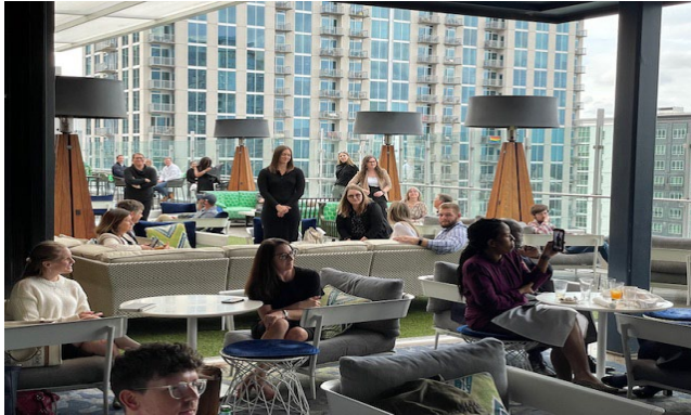
New Architects and Registered Interior Designers celebrate licensure and registration.